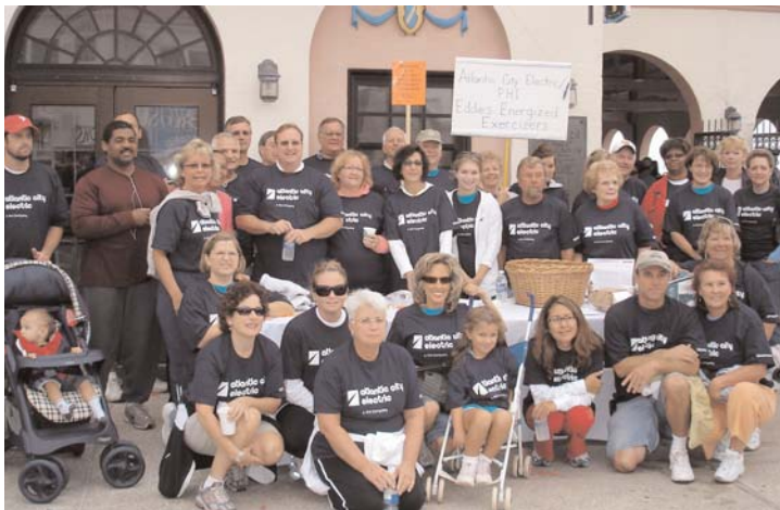
More than 40 team walkers raised $9,000 at this year's ALS Walk held on the Ocean City Boardwalk, September 27.

The NNO event heightens awareness of crime and drug prevention and strengthens partnerships between communities, law enforcement, nonprofit agencies and businesses.