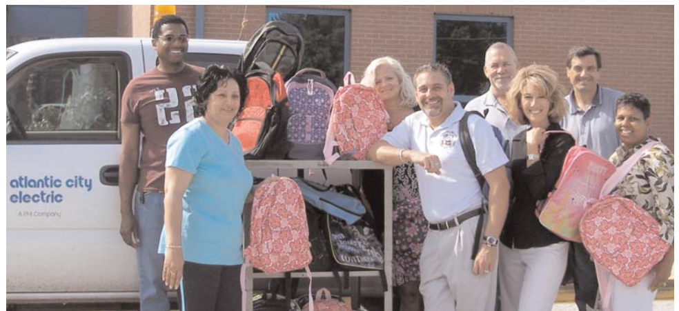
Atlantic City Electric's Glassboro employee volunteers collect school supplies to help less fortunate elementary school students get off to a strong start for the 2008-2009 school year. Students from Winslow School # 4, Charles L. Spragg, Deerfield Twp., Holly Heights School and Dorothy L. Bullock elementary schools received more than 75 backpacks filled with supplies.